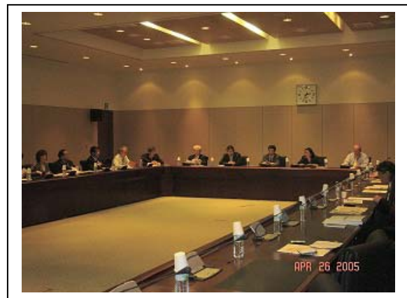
UFI members from throughout Asia developed ideas on how to best profit from opportunities provided through UFI membership.