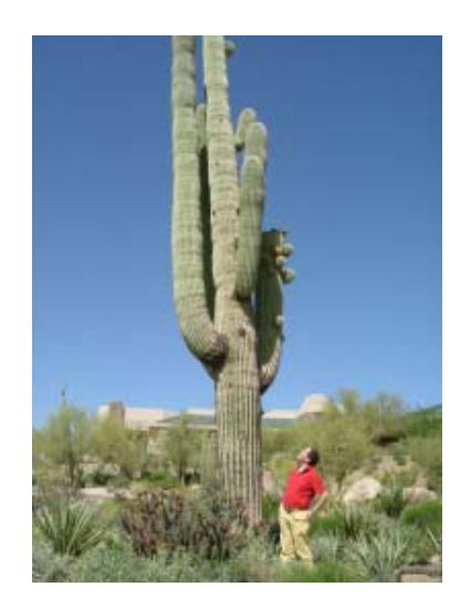
UFI's Managing Director tackling a giant cactus in Arizona during a recent SISO meeting.

We've returned from our holidays with renewed vigour to tackle one of the thorniest topics facing our industry today – standards. More and more of our industry leaders around the globe are seeking credible quantitative and qualitative information to support our industry's position within the marketing mix. It is no longer sufficient to just say that we are the best all-around media – we must now prove it if we are to retain our share of corporate marketing budgets.