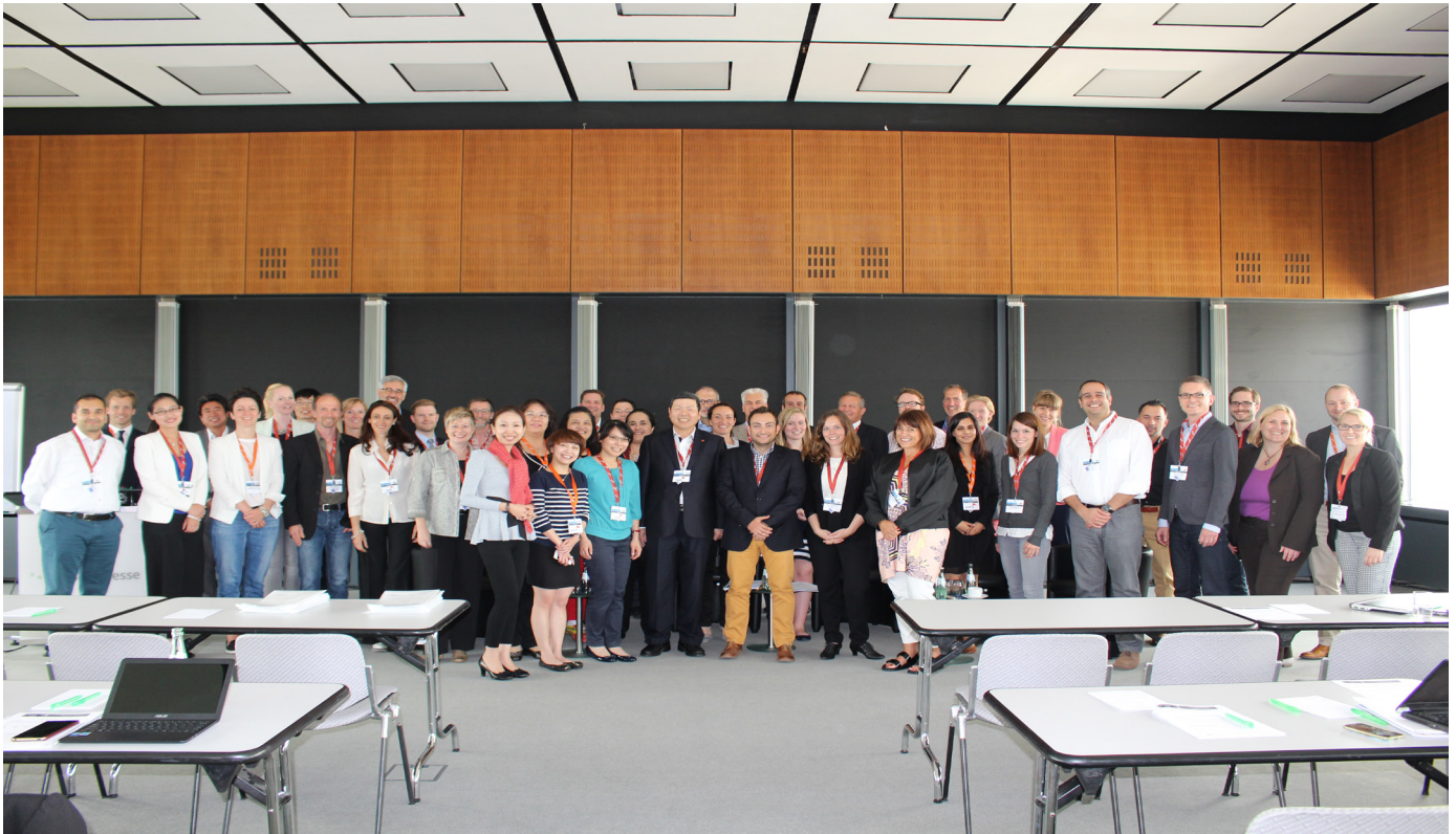
group picture