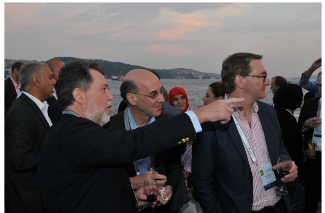
Photo: Networking dinner cruise on the Bosphorus