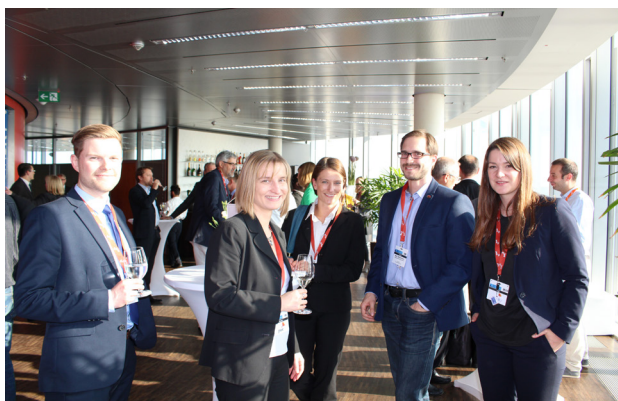
Photo: Networking dinner