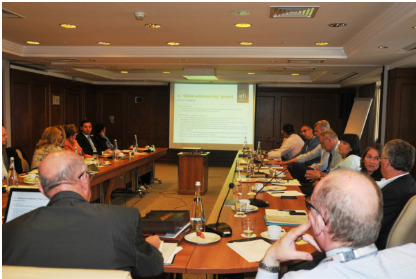
Photo: Associations' Committee Meeting in Istanbul, Turkey

More than twenty representatives of national and international exhibition associations gathered at this meeting. The agenda included: