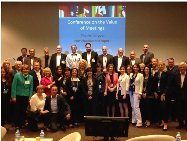
Photo: JMIC Conference participants

UFI took part in a conference organised by the Joint Meetings Industry Council (JMIC) on 14 and 15 May in Paris focused on better definition and communication of the value of events.