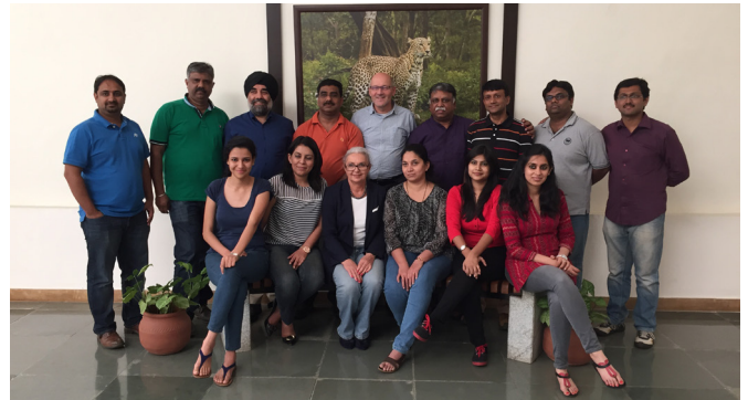
Photo: UFI-EMD in India participants