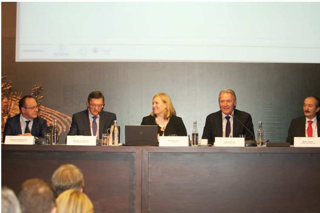
Photo: European Chapter Meeting during the UFI Congress in Bogotá, Colombia 2014.

If you have any questions on the chapter or the event please contact event@ufi.org and follow us on twitter #ufiistanbul.