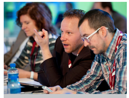
Cover Photo: Operations and ICT Focus Meeting 2012