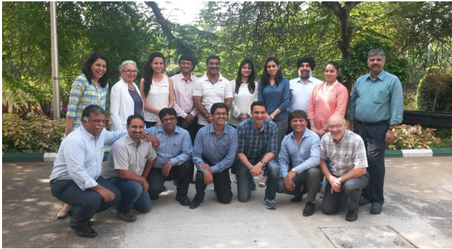
Photo: UFI-EMD in India participants

The first Module of the first ever UFI-EMD in India was recently hosted by the Bangalore International Exhibition Centre (BIEC), providing its 15 attendees with the necessary know-how to successfully manage exhibitions, convention centres and conferences.