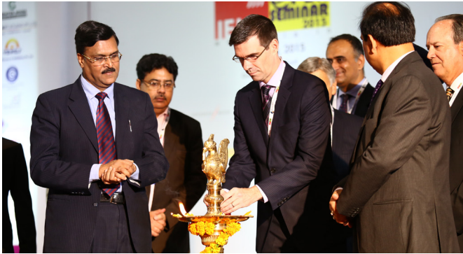
Photo: Lamp lighting ceremony

Last month, the Indian Exhibition Industry Association (IEIA), held its annual open seminar in New Delhi. The Indian exhibition industry gathered at the India Exposition Mart (IEMM) in Greater Noida, on 8 and 9 May. The theme of this year's seminar was "Excellence in Exhibitions."