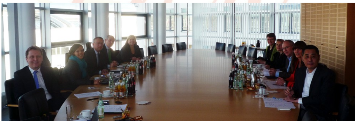
UFI's Marketing Committee meeting in Munich recently.