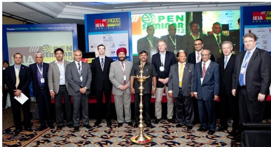
Candle lighting opening ceremony in Mumbai. The next edition of the IEIA Open Seminar will be held in April 2013 in New Delhi.

The delegates in Mumbai also expressed enthusiastic support for UFI's initiative to convince the government in New Delhi that venue capacity in Mumbai and New Delhi is an issue which requires immediate attention.