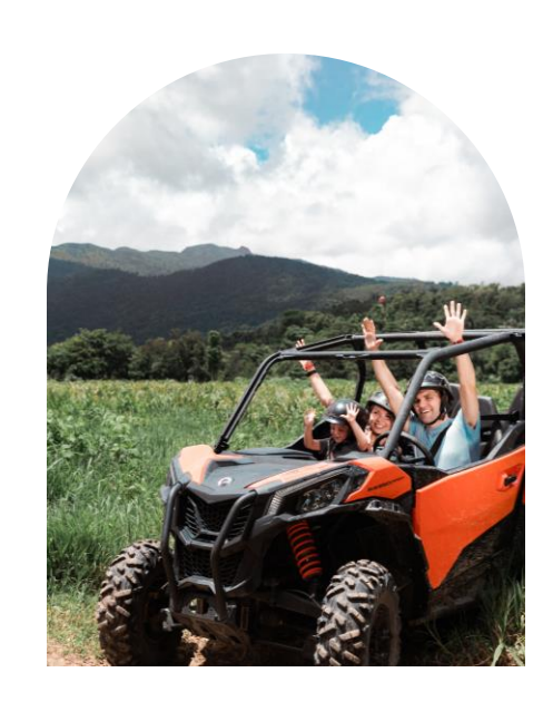
NATURE AND ADVENTURE

World renowned cuisine, coffee, chocolate and rum